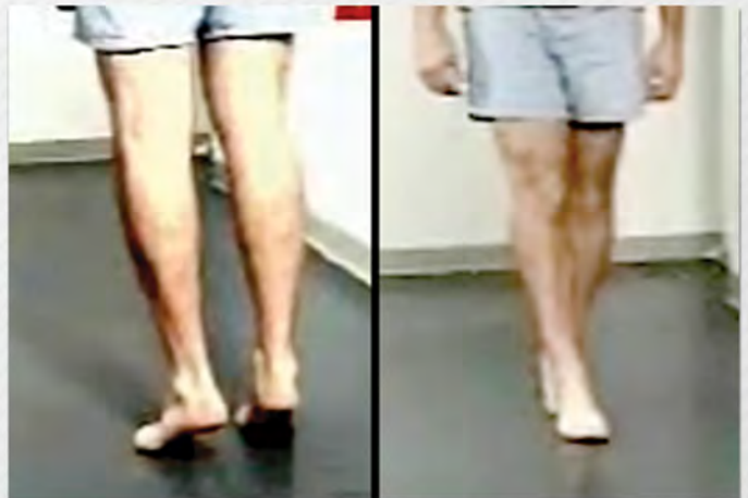
Gait and Station